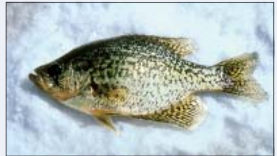
What can a kid catch through the ice? Pickerel, perch, bass and the ever-popular crappie.

Is the ice safe? Well, the honest answer is that no ice is ever safe, but here are a few guidelines: Solid, clear ice of 5 to 6 inches is adequate for small groups; ice thickness of 8 inches and up is good for large groups. Be aware that ice can be weakened by objects frozen into the ice, because they hold the heat from the sun; avoid docks, large rocks and trees fallen onto the ice. Always check the ice before you go out. Use the spud to thump the ice as hard as you can; if the spud does not break through, continue onto the ice. Make a test hole to check the thickness where the spud hit, and check the ice at intervals on your way out to your